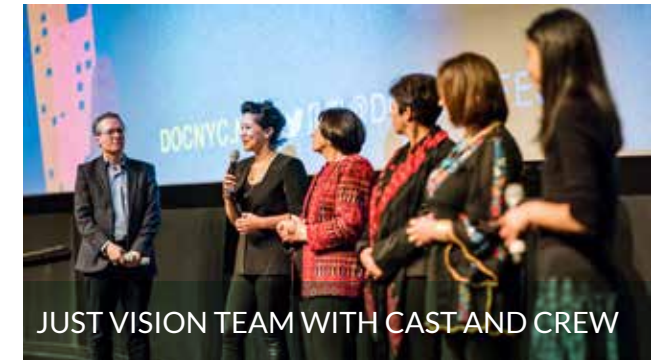
JUST VISION TEAM WITH CAST AND CREW