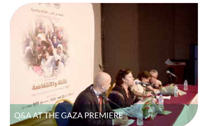
Q&A AT THE GAZA PREMIERE