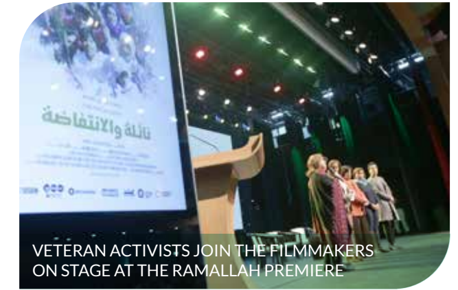
VETERAN ACTIVISTS JOIN THE FILMMAKERS ON STAGE AT THE RAMALLAH PREMIERE

FULL HOUSE AT THE PALESTINIAN RED CRESCENT FOR OUR WEST BANK PREMIERE IN RAMALLAH