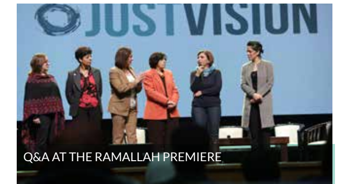
Q&A AT THE RAMALLAH PREMIERE