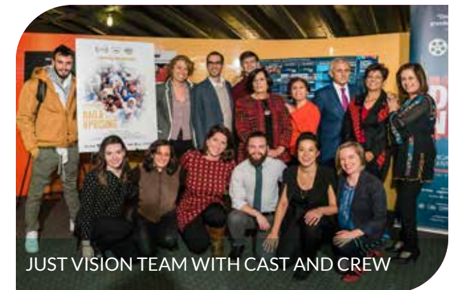
JUST VISION TEAM WITH CAST AND CREW