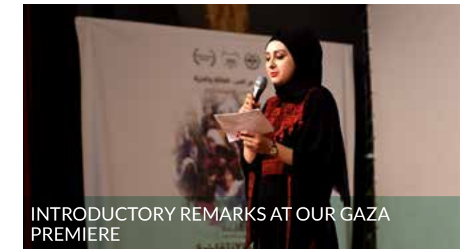
INTRODUCTORY REMARKS AT OUR GAZA PREMIERE